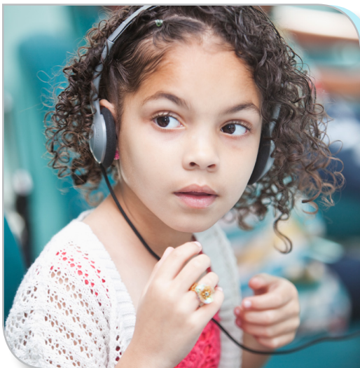
Accessibility features and accommodations allow more students to participate in the PARCC assessments.